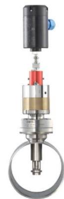
Figure 2: Sensor installed in sensor retraction tool

The BARTEC BENKE's trace moisture sensors are trimmed to superior robustness.